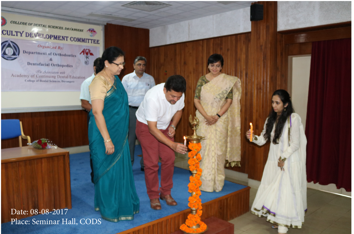
Date: 08-08-2017 Place: Seminar Hall, CODS