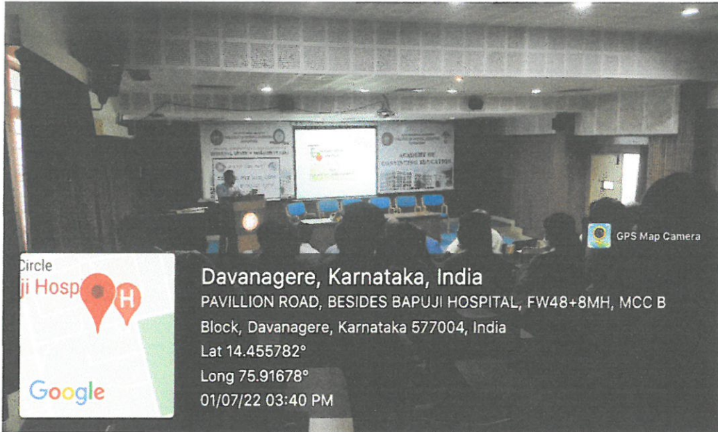
The speaker delivering the guest lecture