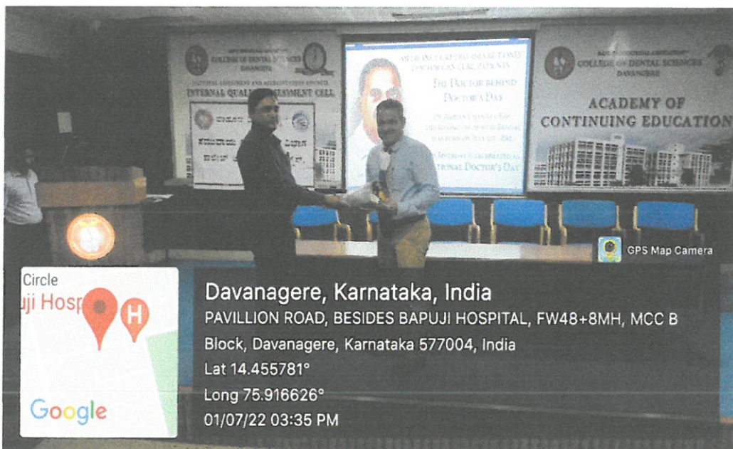
Inviting the guest speaker on to the dias