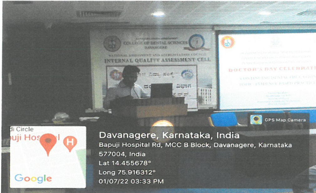
Introducing the guest speaker to the audience