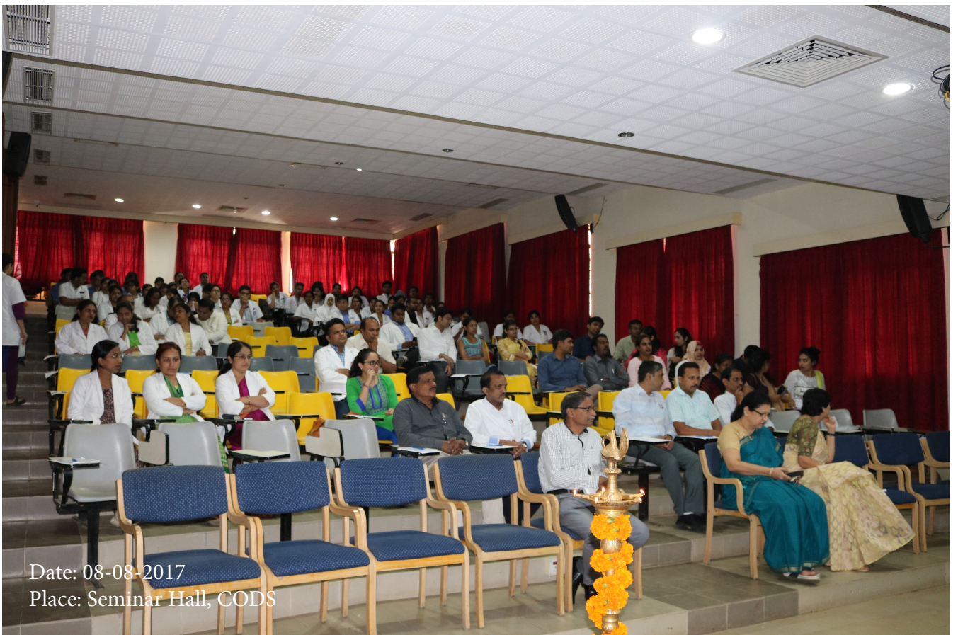
Date: 08-08-2017 Place: Seminar Hall, CODS